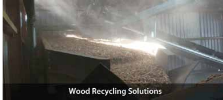
Wood Recycling Solutions

Process more material, minimise downtime, build profitability