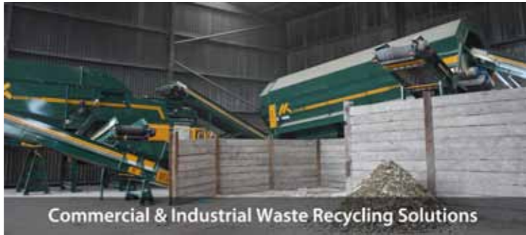
Commercial & Industrial Waste Recycling Solutions