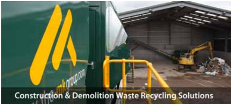
Construction & Demolition Waste Recycling Solutions