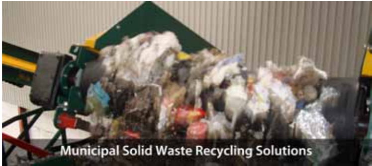
Municipal Solid Waste Recycling Solutions