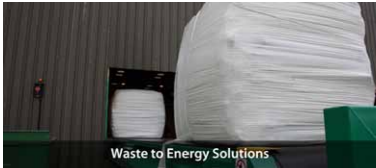
Waste to Energy Solutions