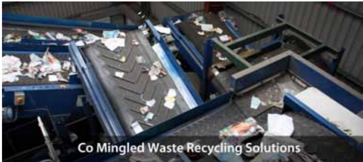
Co Mingled Waste Recycling Solutions