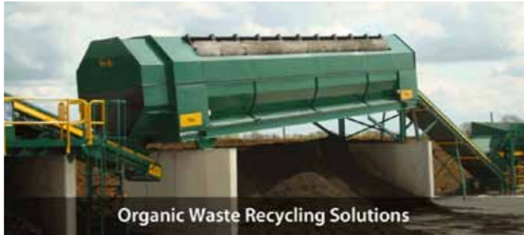
Organic Waste Recycling Solutions